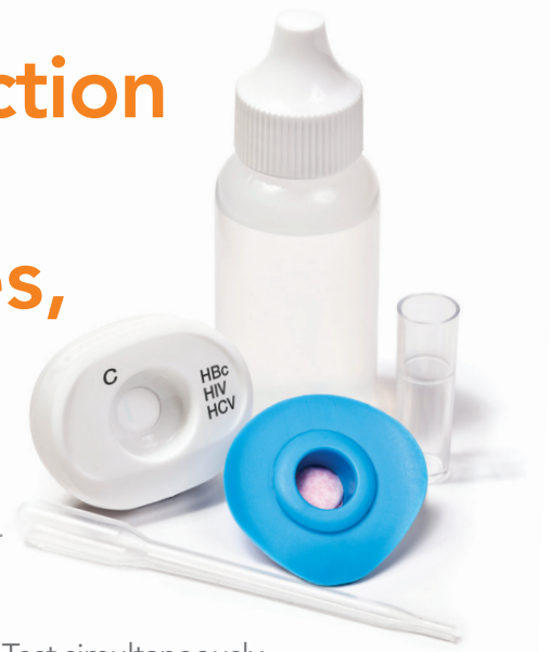
Multipl Rapid HBc/HIV/HCV Antibody Test.

Multipl Rapid HBc/HIV/HCV Antibody Test simultaneously detects antibodies for HIV-1/2, hepatitis B and hepatitis C in a single test.